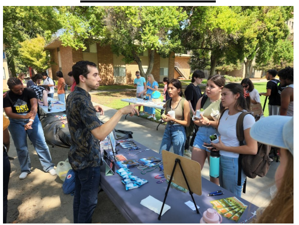
Club Fair at Fresno Pacific