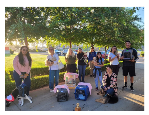
Blessing of the Animals