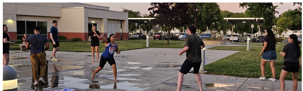
Wednesday Water Balloon Fight