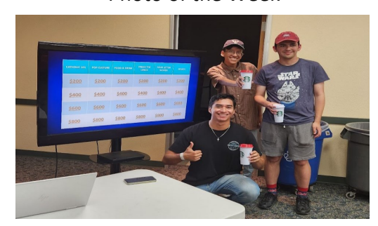
Student Jeopardy Winners