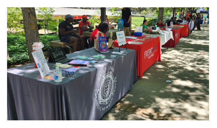
Tabling at Dog Days