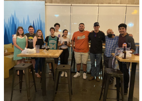
Young Adults Take 1st Place in Trivia

Join our Bible Study gathering this Monday, June 10th at 6:00 pm in the Student Lounge. We will continue to look at the Gospel of Luke. Come and join other young adults to learn about how scripture is alive in our daily lives.