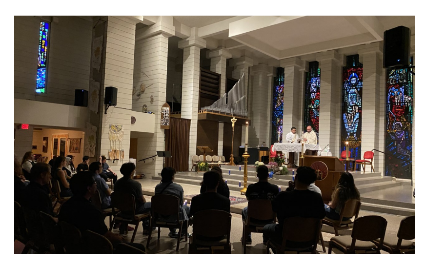
Wednesday Student Night Mass

Join us for an evening of worship music and s'mores making! This Friday, April 26th at 6:30pm, outside the student lounge. See you there!