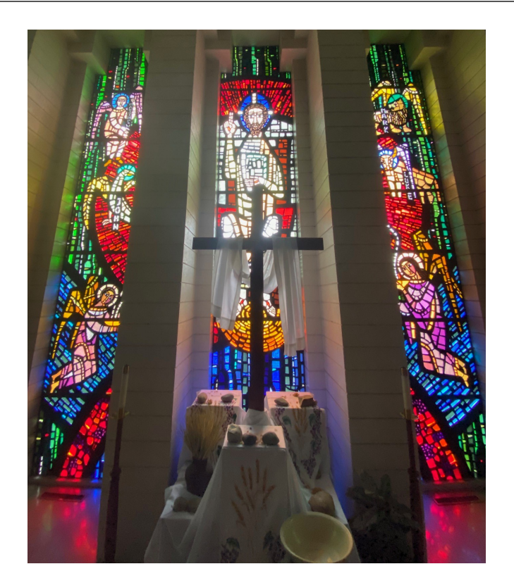
THE STONE REMOVED