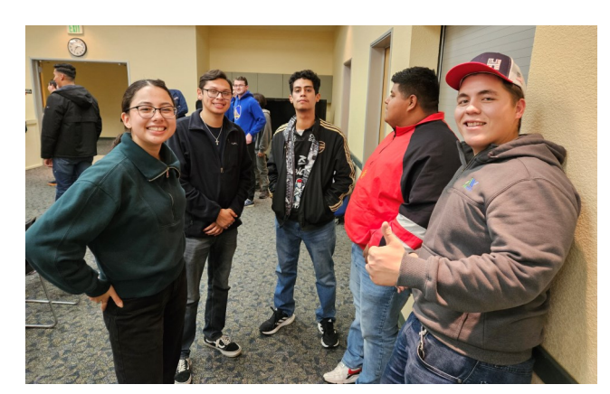
First Student Dinner of 2024

Students are invited to serve as Eucharistic ministers, lectors, altar servers, ushers, music team, and more. You can email us at CatholicClub@csufnewman.com or speak to one of our student service leaders.